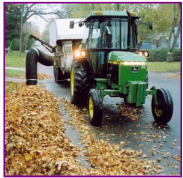
service to residents' garbage and recycling.